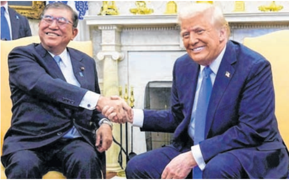
US President Trump shakes hands with Japan’s Prime Minister Shigeru Ishiba at the White House. —File photo

Meanwhile, Trump said a trip to China might be “not too